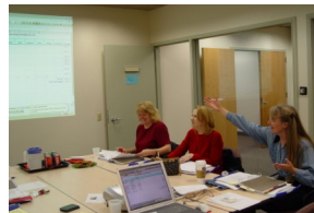
Panel members discuss program merits at a funding decision meeting.