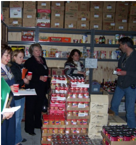
Panel members listen to a presentation at the Community Food Bank site visit.

Just like the Dynamic Duo, United Way partners each year with 60-70 volunteers from across the community for fund allocation. This 'citizen review process' evaluates the effectiveness and efficiency of health and human service programs applying for United Way grants and ultimately makes funding recommendations to the United Way Board of Directors.